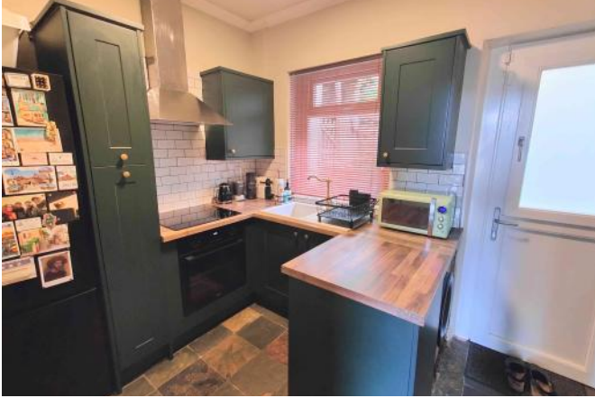
table. With an integrated hob, stainless steel extractor, single radiator, tiled floor, tiled splashbacks, space for a fridge/freezer, cornice to ceiling, central light fitting and an inset sink with mixer tap.